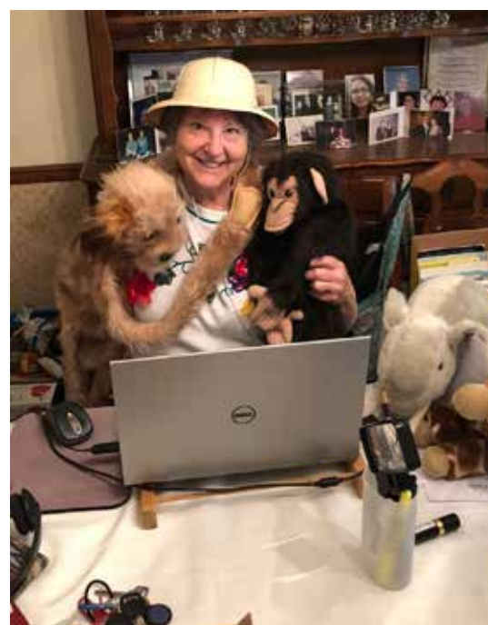
A behind the scenes look at the teachers in their Zoom classrooms at Rose Family Early Childhood Education Center